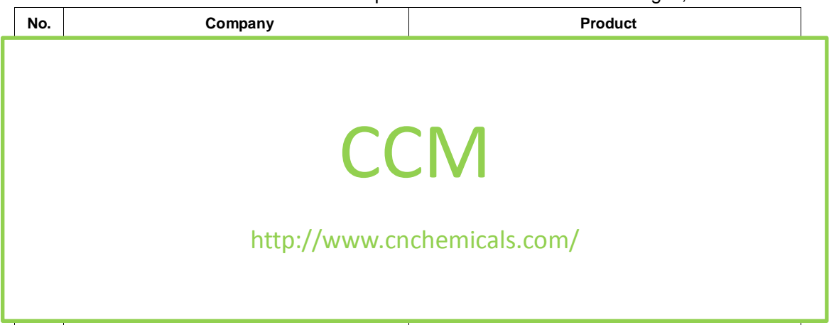
Table 2.5-2 Main end users of acesulfame potassium for carbonated beverages, 2023