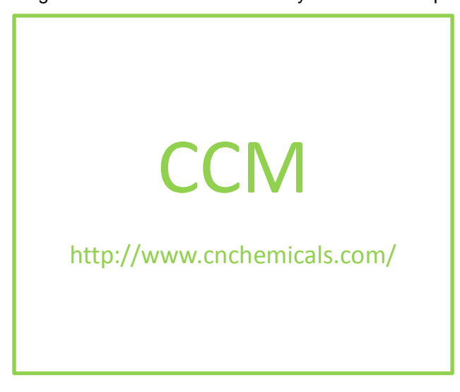
Figure 2.5-1 Downstream industry of acesulfame potassium in China, 2023