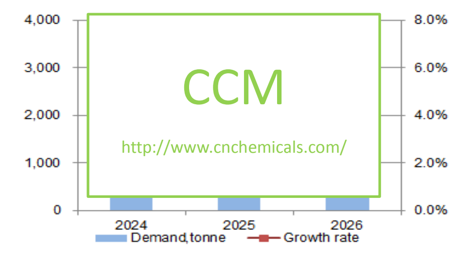
Figure 3.2-1 Forecast on demand for acesulfame potassium in China, 2024–2026