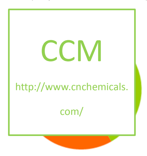
Figure 2.3-1 Capacity distribution of acesulfame potassium in China, 2023