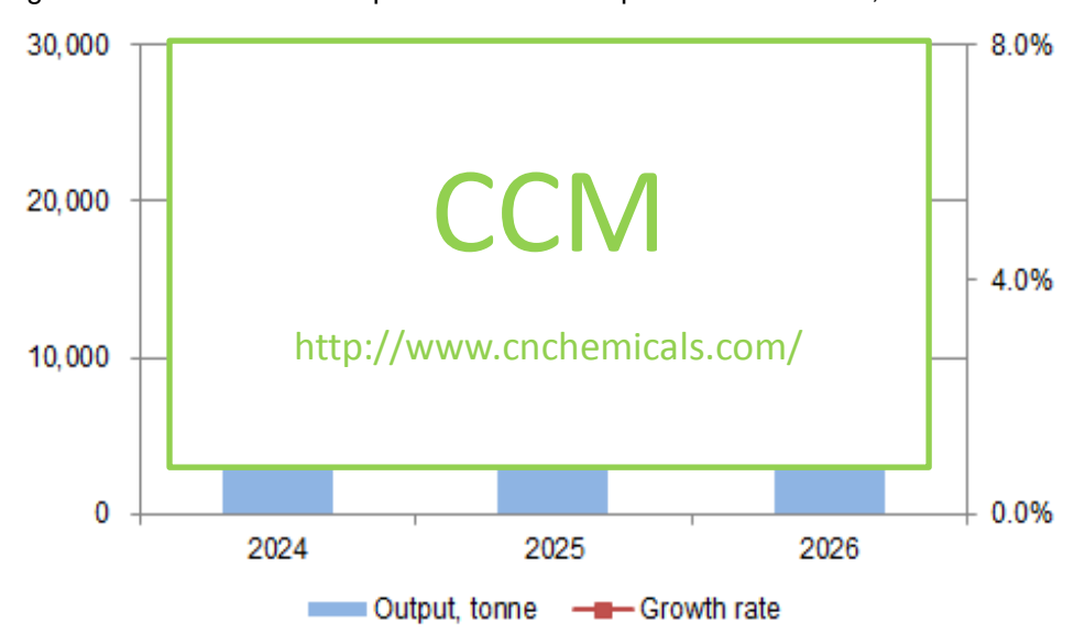
Figure 3.2-2 Forecast on output for acesulfame potassium in China, 2024–2026